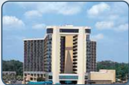
Myrtle Beach Hilton, Kingston Plantation.

The Grand Strand is one of the largest tourism destinations in the United States. According to a poll conducted by Yahoo! Travel, Myrtle Beach was rated the “Worlds Greatest Beach” for 2007. The American Automobile Association (AAA) estimates that Myrtle Beach and the Grand Strand is the third most popular vacation destination by car in the United States. According to the South Carolina Employment Security Commission, the Hospitality industry accounted for over 37,900 permanent jobs in Horry County for 2005. The county leads all counties of the State in visitor spending, lodging rentals, employment and tax revenues resulting from travel and tourism.