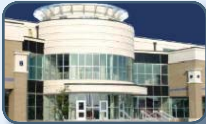
Horry-Georgetown Technical College in Conway.